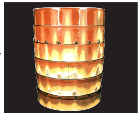
MC470-9 giving a thermal profile on an aerospace combustion engine

Multi Change Thermal Paints prove a valuable asset, particularly when used in conjunction with gas turbines and jet engines. Being the only paint of its type known to retain its surface adhesion at these temperatures, thus offering a high degree of protection from erosion. Used extensively in rocketry and high speed flight technology, these paints prove to be an invaluable tool in thermal measurement.